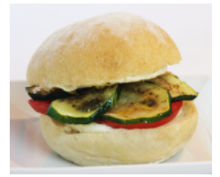
Roasted zucchini, pesto, cream cheese and tomato 烤翠玉瓜、蕃茄、 忌廉芝士配青醬