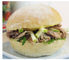
Pulled suckling pig, apple and mustard mayo 乳豬、青蘋果 配芥末蛋黃醬