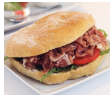
Parma ham with tomato, rocket and pesto 巴馬火腿、蕃茄、 火箭菜配青醬