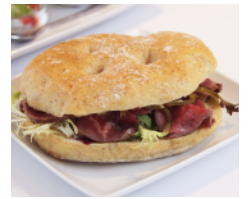
Roast beef with pickles, mixed greens and mustard mayo 烤牛肉、腌黃瓜 配芥末蛋黃醬