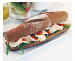
Chicken breast with dry tomato, rocket and thousand island dressing 雞胸肉、蕃茄干、 火箭菜配千島醬