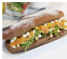
Cured salmon, fennel mayo, egg and mixed greens 腌三文魚、雞蛋配蛋黃醬