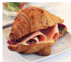
Ham and cheese croissant with mixed greens 火腿、芝士牛角包