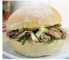
Pulled suckling pig, apple and mustard mayo 乳豬、青蘋果 配芥末蛋黃醬