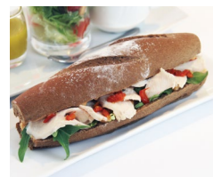
Chicken breast with dry tomato, rocket and thousand island dressing 雞胸肉、蕃茄干、 火箭菜配千島醬