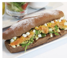
Cured salmon, fennel mayo, egg and mixed greens 腌三文魚、雞蛋配蛋黃醬