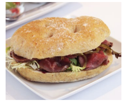
Roast beef with pickles, mixed greens and mustard mayo 烤牛肉、腌黃瓜 配芥末蛋黃醬