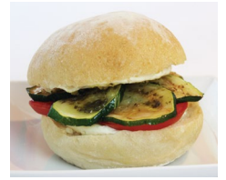
Roasted zucchini, pesto, cream cheese and tomato 烤翠玉瓜、蕃茄、 忌廉芝士配青醬