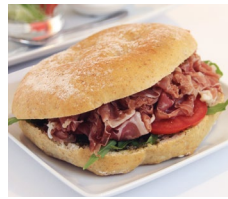
Parma ham with tomato, rocket and pesto 巴馬火腿、蕃茄、 火箭菜配青醬