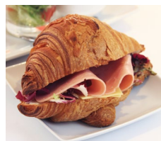
Ham and cheese croissant with mixed greens 火腿、芝士牛角包