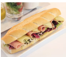
Ham and cheese with mixed green salad 火腿、芝士 配青菜沙律