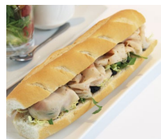
Smoked turkey, olive tapenade and rocket greens 煙火雞、火箭菜 配橄欖醬