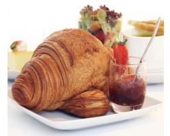
Strawberry jam croissant 草莓果醬牛角包